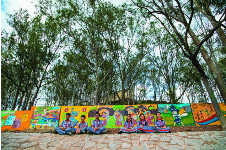
Students sit by the wall where educational slogans are painted, so the message is never forgotten

To realize meaningful results from its CSR activities, the company has earmarked thrust areas for its CSR which include education, skill development, healthcare, environment, community development, women empowerment, sustained development leading to self-reliance and creation of plastic-free zones.