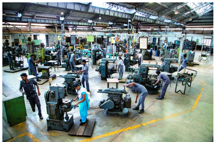
ITI interns being trained on machines in Kolar

Knowledge leads to a good base and results in a progressive nation. Following this motto and to catch people young, inculcate values and proper education in them, the company has set up four schools under its umbrella. Here, education is imparted from nursery to pre-university (PU) levels. In 2018, around 3,309 students benefited with quality education provided by BEML schools. Out of this, 1,789 were non-BEML wards, making up 54% of the students in the schools. The company also provided 12 ‘value education kits’ to the teachers of the schools it operates in KGF and Bengaluru.