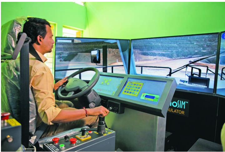
Simulator experience at the Centre of Excellence

Besides being green, the school also has a focus on new methods of teaching and digital learning. It has six e-classrooms which are fully equipped to provide digital education and are at par with any modern school. The students take part in state and national-level science exhibitions and competitions frequently. Meritorious students have participated in national programmes like 'Pariksha pe Charcha'.