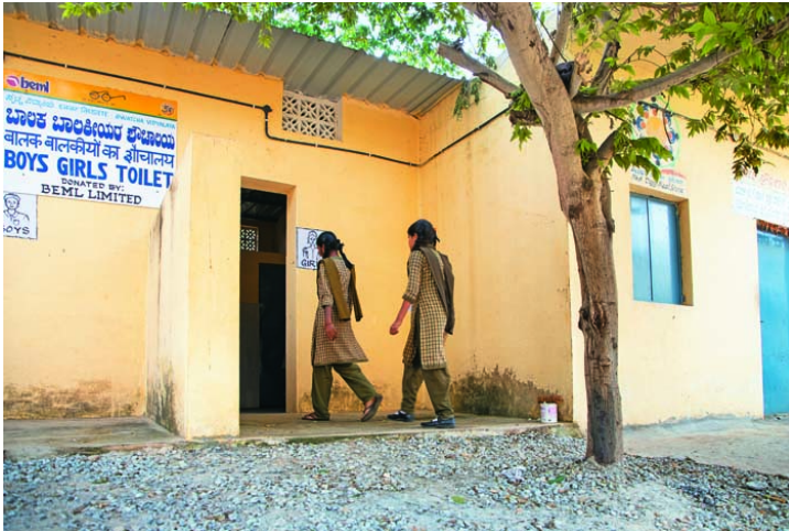
Boys and girls in many schools around the units now have access to clean and good toilets

Tuberculosis and polio camps are also held from time to time. Children are the largest beneficiaries as more than 30 per cent get free access to the polio immunisation programme. An annual voluntary blood donation camp is also organised at the BEML Medical Centre. With over 100 units of blood collected, 30 units are preserved in the blood bank and 70 units shifted to the government hospital.