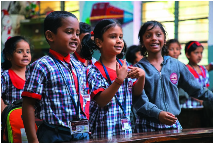
At schools supported by BEML, every morning is bright

Water bodies have also been created across BEML Nagar for the same purpose. These water resources are mainly used by the wildlife in that area. Within the golf course, check-dams and planned leveling have led to the creation of water bodies. Besides rainwater harvesting, these also prevent soil erosion and enriches soil fertility. Even in the Mysuru Complex, two ponds have been created for ground water recharge. At the KGF unit, a rooftop rainwater harvesting unit has also been installed.