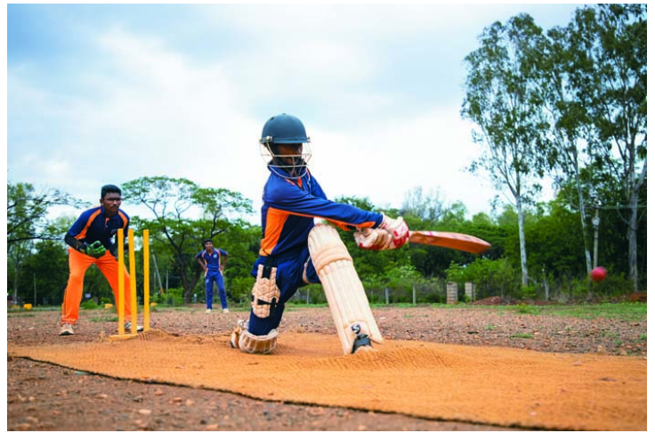
BEML supports sports and has given a ground to a cricket academy