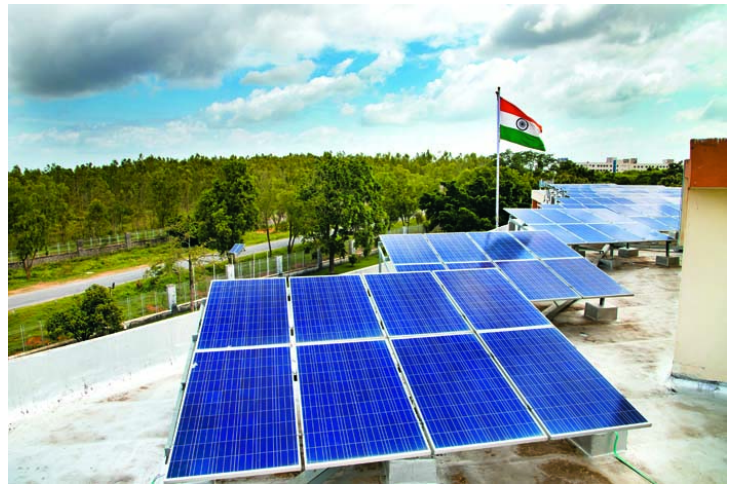
With a 200 KW solar panel, Mysuru Complex is energy-friendly

To sum it up the BEML way, "Implementing green practices in home and office can reduce waste, conserve natural resources and improve both air and water quality while protecting the environment and lending a hand towards bio-diversity".