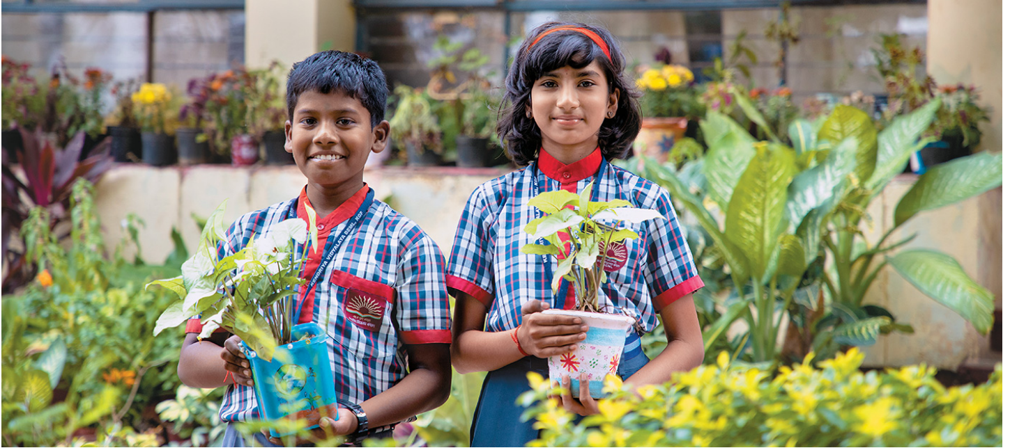
Children learn the 'green way' at the Kendriya Vidyalaya at Kolar Gold Fields