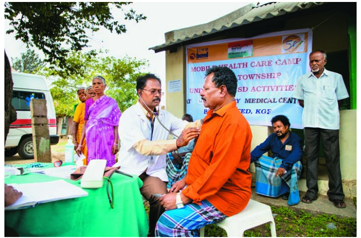
Healthcare camp at Marikuppam, KGF

“Normally three camps are held at the same time in different villages. The villages of Oorgam, Marikuppam, Champion Reef, and Ajjapalli have a constant influx of patients. All records are maintained and medicine is given free of cost. The common health issues seen in the area are diabetes, hypertension, dental problems, and musculoskeletal disorders,” says the doctor at a camp in Marikuppam. As an ambulance accompanies the doctor, emergency cases get immediate attention and are sent off to the nearest government hospital for further care. Some are also sent to the BEML Medical Centre. The hospital treats around 36,000 patients in a year.